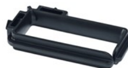
Toolless Cable Management Rings (Qty 10)